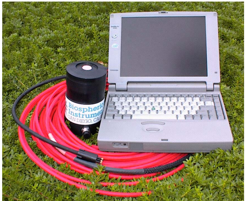
Compact and lightweight, BIC radiometers are very portable and ideal for field research